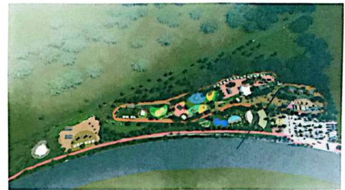
CONCEPTUAL AERIAL PERSPECTIVE