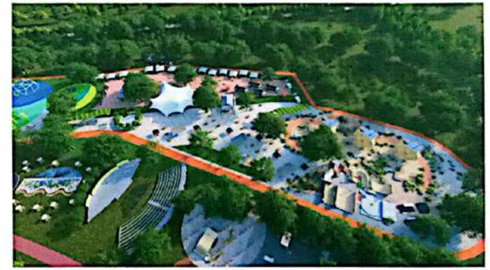
CONCEPTUAL SPOT AERIAL PERSPECTIVES