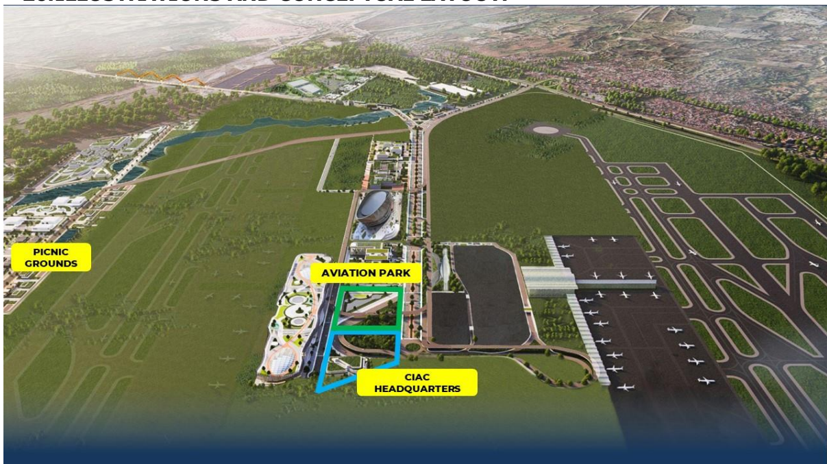
NEW CIAC HQ SITE DEVELOPMENT AREA (A: 3.0 HECTARES minimum)